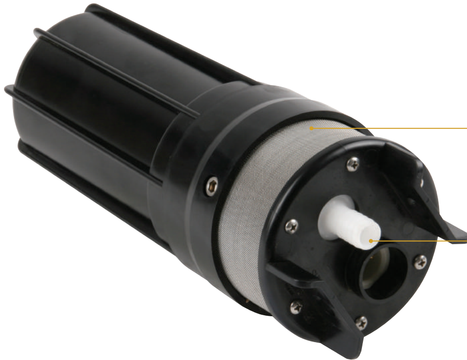
REMOTE WATER PUMP